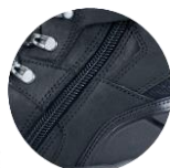
Internal side zip

The upper is made in a single piece of leather, without seams, using greased leather that is water-repellent, soft but robust